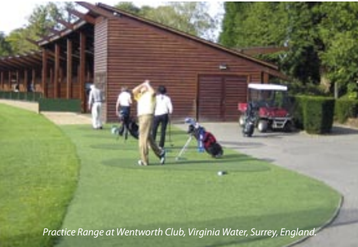
Practice Range at Wentworth Club, Virginia Water, Surrey, England.