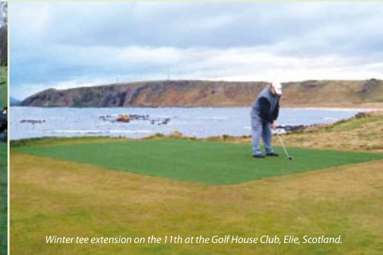
Winter tee extension on the 11th at the Golf House Club, Elie, Scotland.

For further information and guidance on installation and the recommended size of Premier Tee Turf 2 to suit your specific application, please contact: