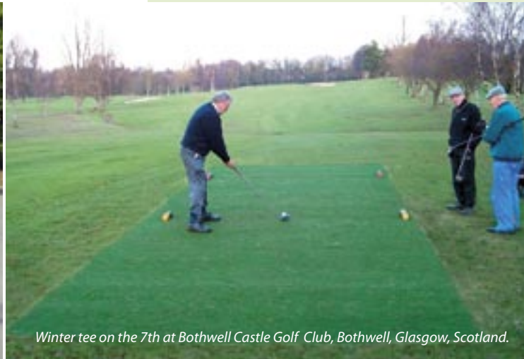
Winter tee on the 7th at Bothwell Castle Golf Club, Bothwell, Glasgow, Scotland.